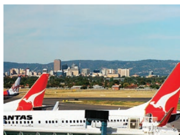
Adelaide Airport, photo by Adam Trevorrow, courtesy of Creative Commons

TTF SPECIYPAD 112200Z 00000KT 2000 +DZ OVC005 12/11 Q1020 RMK RF00.8/001.8 FM2200 32005KT 9999 NSW BKN008 FM2300 04005KT 9999 NSW SCT020