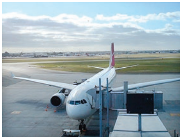
Perth Airport, photo courtesy of Creative Commons

PROB forecasts are not used in TTF. Users should refer to TAF for any likelihood (30 or 40%) of other conditions occurring.