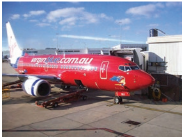
Melbourne Airport

TTF SPECIYMML 092200Z 00000KT 0300 R16/0300N R27/0350N FG 09/09 Q1017 RMK RF00.0/001.8 NOSIG