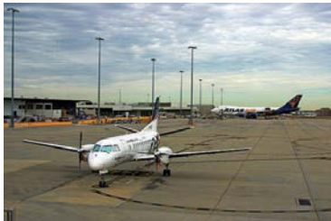
Melbourne Airport.

TAF AMD YMML 292330Z 3000/3106 14008KT 9999 SCT030 FM301100 14003KT 3000 HZ BKN009 PROB40 3017/3023 0400 FG RMK T 14 15 17 14 Q 1016 1014 1013 1014 TAF3