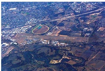
Aerial view of Albury Airport.

TAF YMAY 022230Z 0300/0312 35010KT CAVOK FM030800 31018KT 9999 SHRA BKN025 OVC100 INTER 0308/0312 31020G40KT 3000 +TSRA BKN010 SCT040CB RMK FM030600 MOD TURB BLW 5000FT T 23 24 28 33 Q 1012 1013 1014 1009