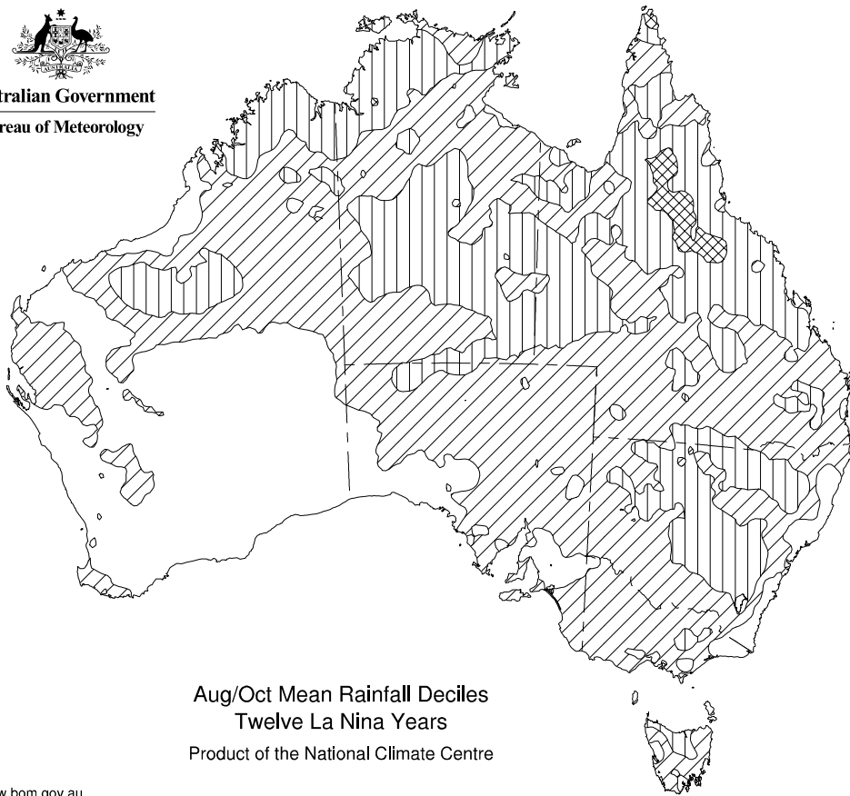
Mean Rainfall Decile Ranges

Australian Government Bureau of Meteorology