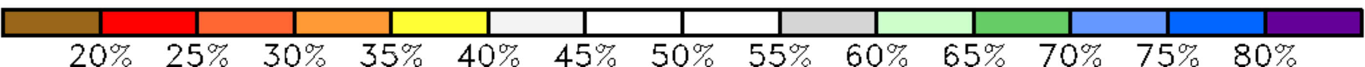
Normal weekly rainfall in OND (mm)