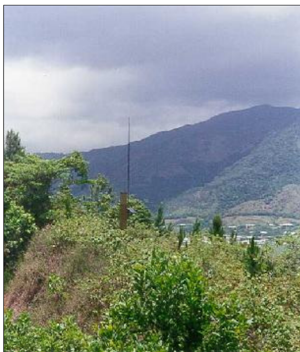
Automatic rainfall station at Brinsmead

This brochure describes the flood warning system operated by the Australian Government, Bureau of Meteorology for the Barron River. It includes reference information which will be useful for understanding Flood Warnings and River Height Bulletins issued by the Bureau's Flood Warning Centre during periods of high rainfall and flooding.