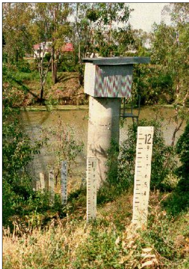
Macintyre River at Goondiwindi

This brochure describes the flood warning system operated by the Australian Government, Bureau of Meteorology for the Macintyre and Weir Rivers. It includes reference information which will be useful for understanding Flood Warnings and River Height Bulletins issued by the Bureau's Flood Warning Centre during periods of high rainfall and flooding.