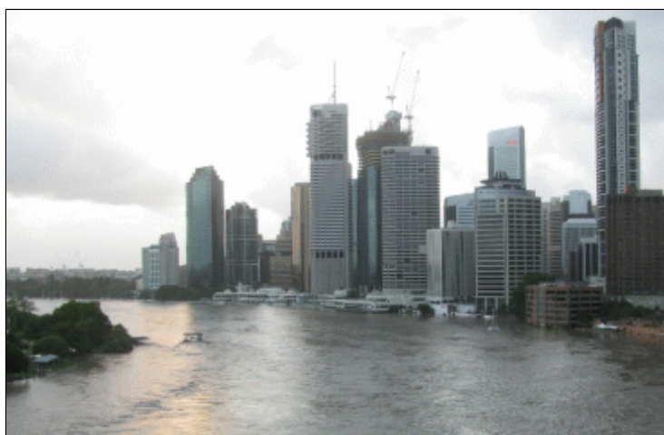
Brisbane City, Wednesday afternoon on the 12th of January 2011, before the Thursday morning peak.

This brochure describes the flood warning system operated by the Australian Government, Bureau of Meteorology for the Brisbane River below Wivenhoe Dam to Brisbane City. It includes reference information which will be useful for understanding Flood Warnings and River Height Bulletins issued by the Bureau's Flood Warning Centre during periods of high rainfall and flooding.