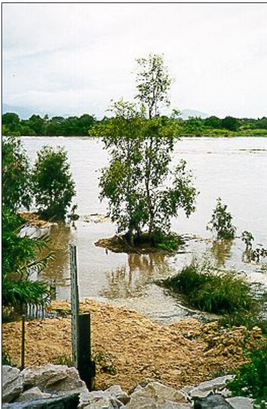
Don River at Bowen, Feb 1999

This brochure describes the flood warning system operated by the Australian Government, Bureau of Meteorology for the Don River. It includes reference information which will be useful for understanding Flood Warnings and River Height Bulletins issued by the Bureau's Flood Warning Centre during periods of high rainfall and flooding.