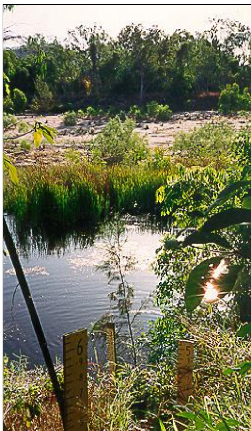
Haughton River at Hustons Farm

This brochure describes the flood warning system operated by the Australian Government, Bureau of Meteorology for the Haughton River. It includes reference information which will be useful for understanding Flood Warnings and River Height Bulletins issued by the Bureau's Flood Warning Centre during periods of high rainfall and flooding.