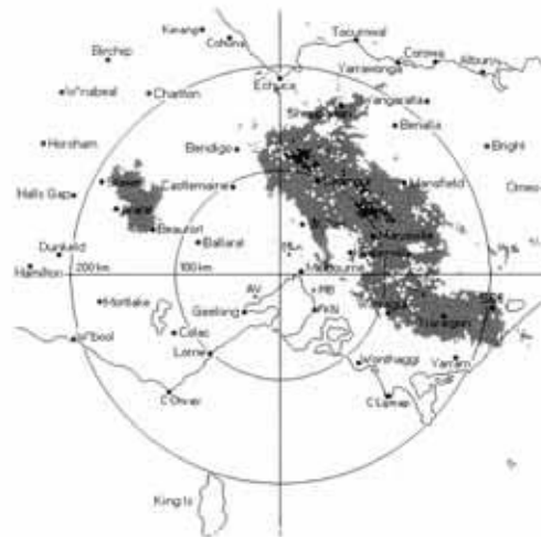
Figure 25. A microphysics scheme such as BEM (Bulk Explicit Microphysics) improves the realism of the representation of moisture in atmospheric models by modelling details of the distribution of cloud, rain water, ice crystals, snow and graupel. In this example, an area of lightning activity forecast by the LAPS model incorporating the BEM scheme (upper panel) corresponds well with radar observations of the position of an area of convective rainfall (lower panel).

timely and accurate manner. To this end, the BMRC has made a significant effort to