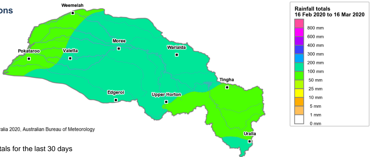
Figure 1: Rainfall totals for the last 30 days