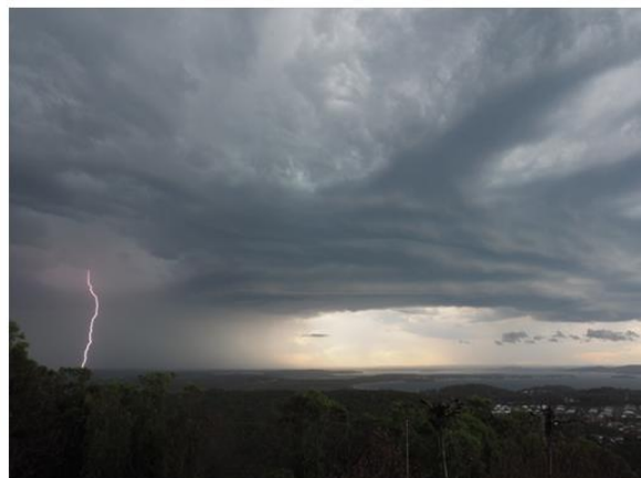
Images: Radar image showing heavy rain and thunderstorms in orange, red and black (left); thunderstorms in action (right)