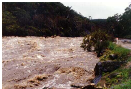
River Torrens in flood. 30 th August 1992.