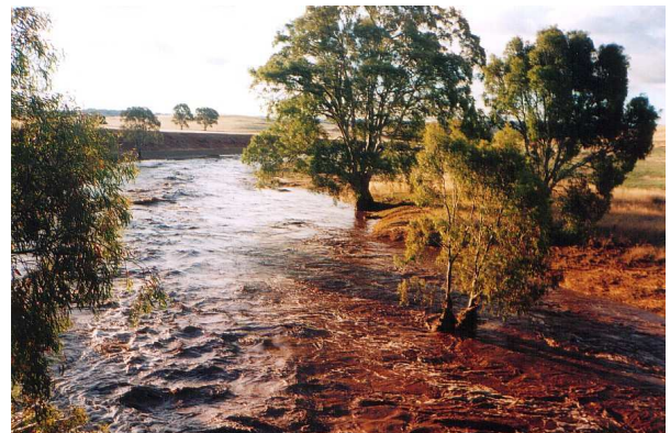
River Light in flood 25 th December 1999