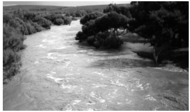
Inman River in flood, 7 th August 1981 from the bridge over the Inman River looking downstream.