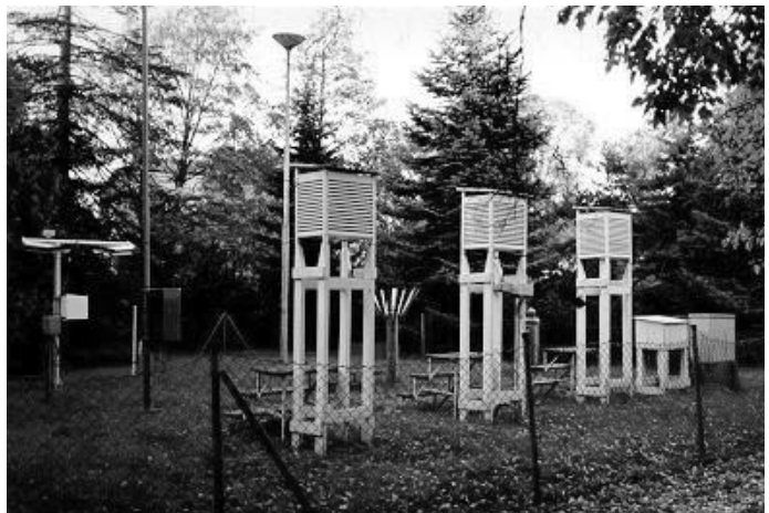
Figure 2 — An example of a parallel observations programme in Helsinki, Finland. Such programmes are required when there are changes in observation systems or site location and comparison data are required to enable homogeneity to be preserved.

Much can, and has, been said about these principles but there are perhaps two basic messages for climatologists. Firstly, climatologists cannot afford to be passive when it comes to accepting proposed observation network and system changes. They must open