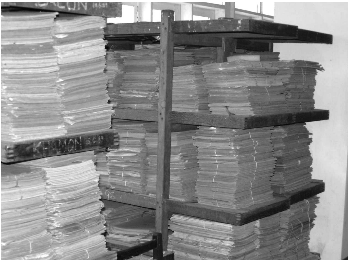
Figure 4 — Historical climate records awaiting digitizing. It is important that—unlike this example—records are maintained in a suitably air conditioned room.

At the recent Malaga meeting, WMO CCI experts began drafting guidance material on data rescue. When completed, this guidance will provide NMHSs with essential information required to